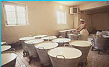
separation of curd and whey