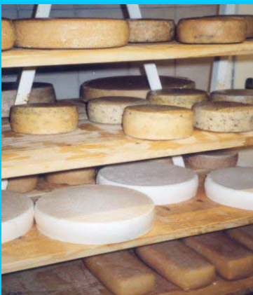
process of ripeness