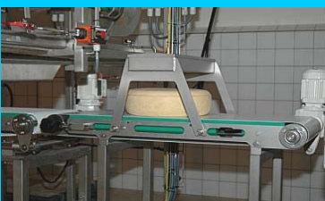
TS-rating at conveyor-belt

Lab ferment cheese is soft-, sliceable- or hard cheese.